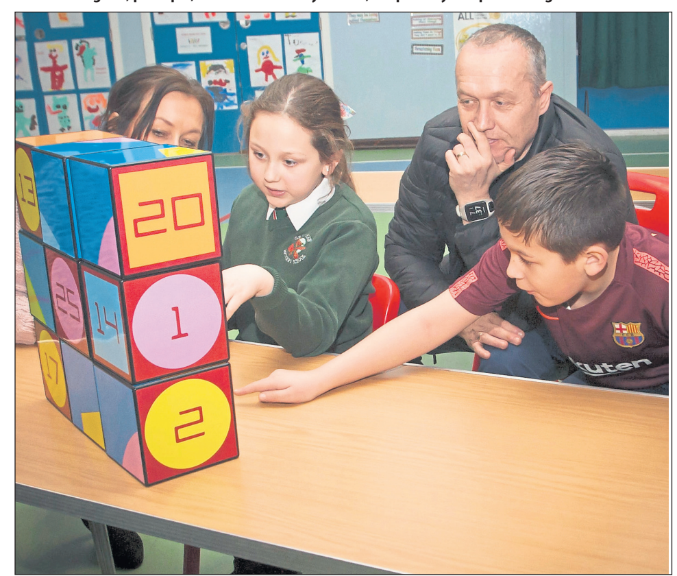
Working out the maths...