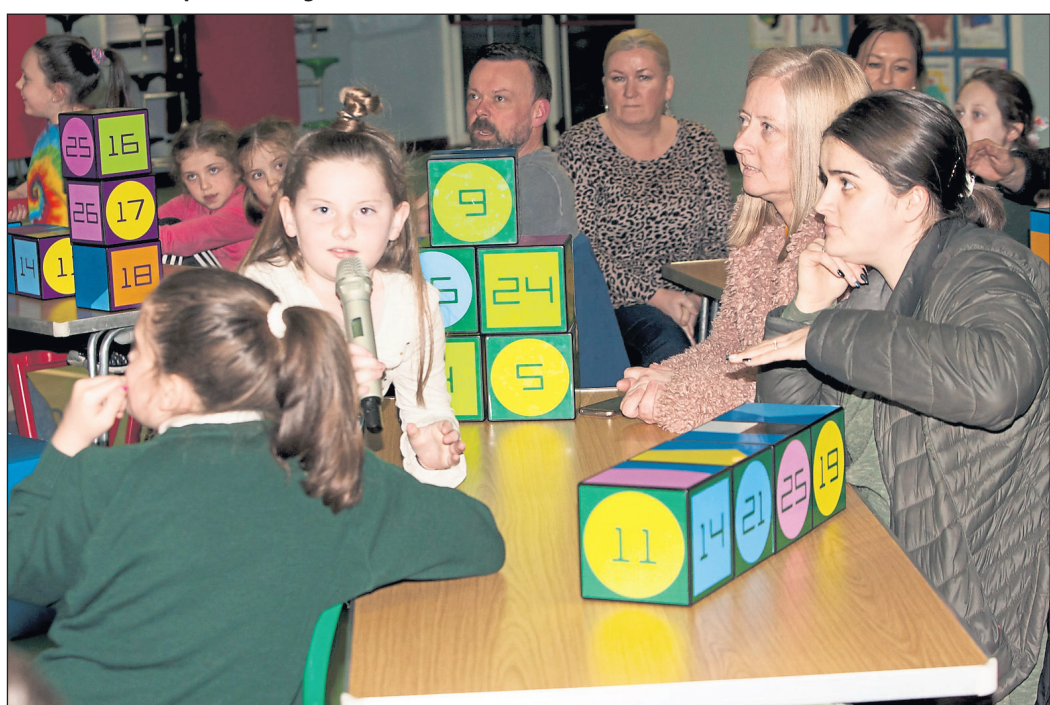
Parents and children enjoying the fun.