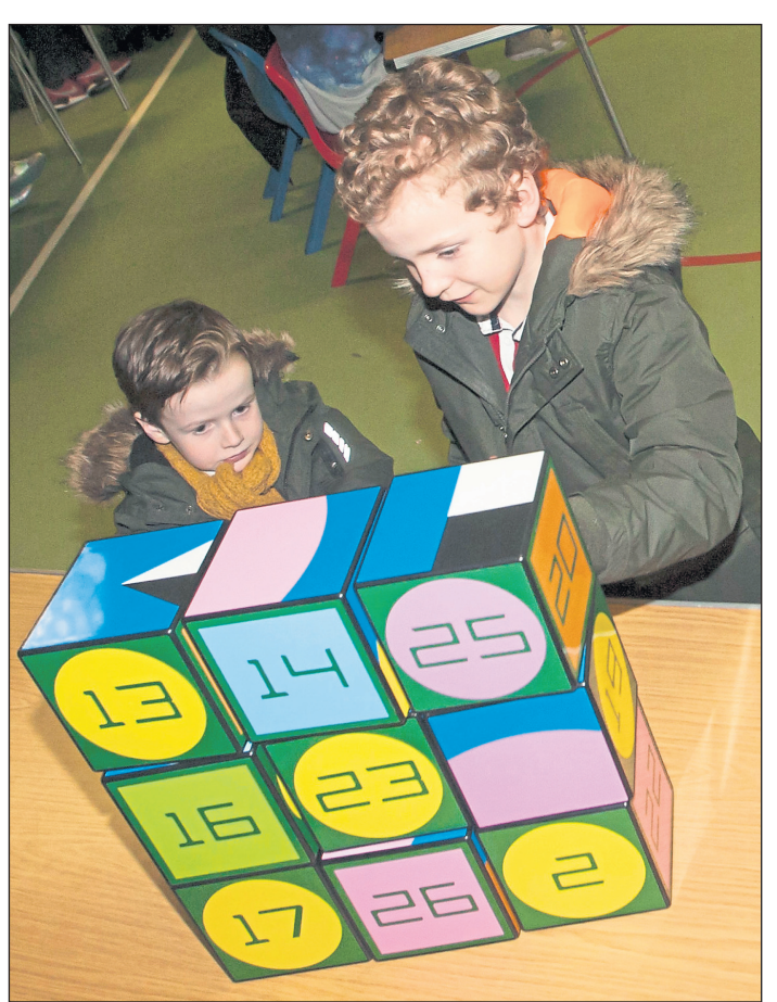
Two of the younger generation enjoying the maths challenges.